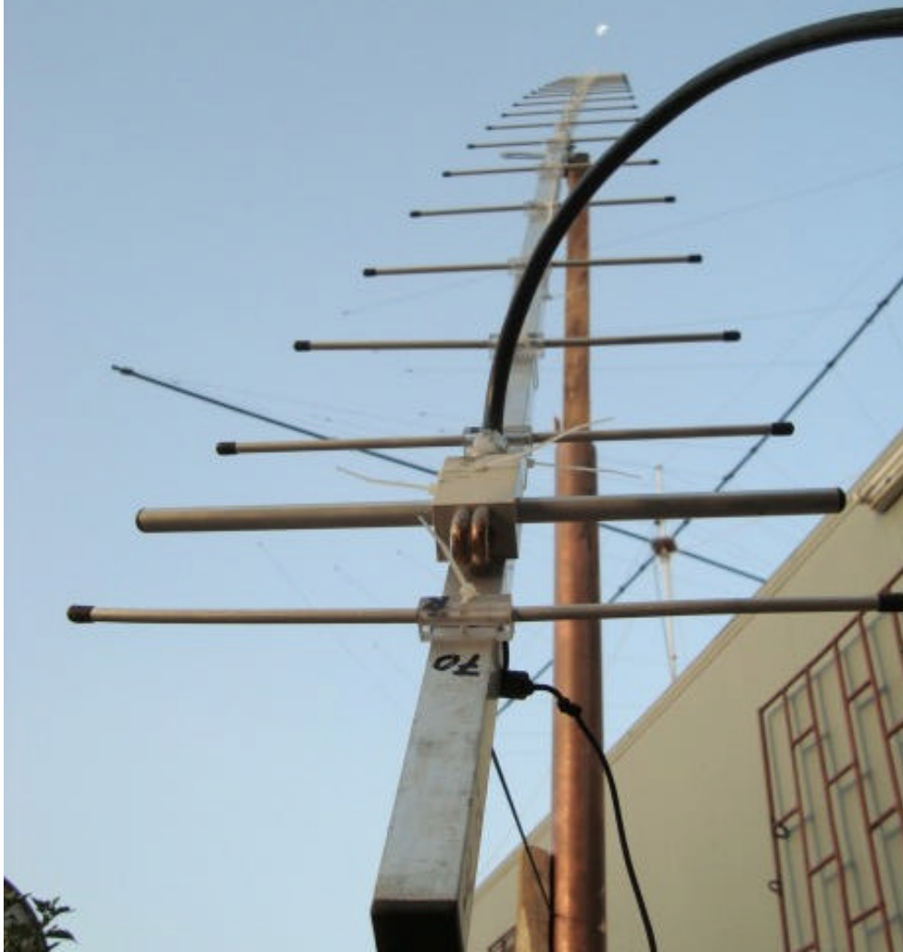
5N0EME 70 cm yagi pointed to Moon