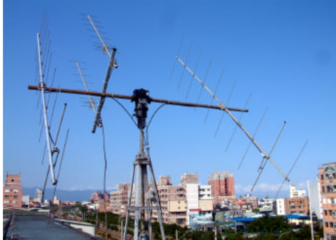
BX1AD 2 yagi array used on 70 cm EME