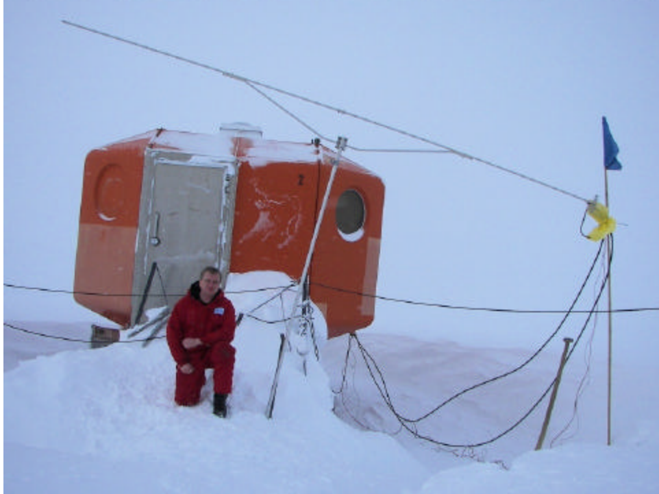
Felix operating location.