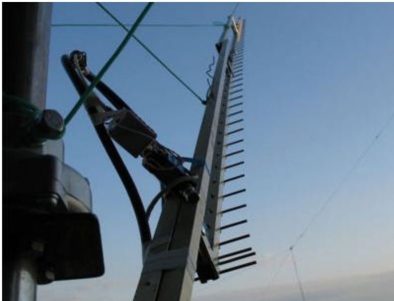
RA0ACM's single yagi used on 23 cm EME aimed a Moon

Sergey in NO76 is QRV on 23 cm using a single 49 el yagi, 75 W from 2 x RA18H1213G SSPA, G4DDK LNA, DB6NT transverter/TS-2000. During the ARI Digital EME Contest he worked OK1DFC (22DB/26DB) on JT65c.