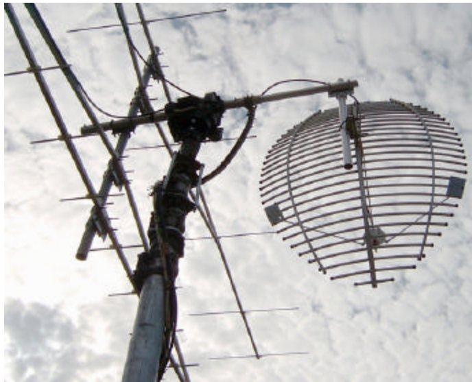
OK1TEH's antennas including dish used on 23 cm EME

UA9FAD is now QRV on 1296 EME using a 1.2 m dish with 0.25 f/d and linear pol with 120 W at the feed. He has thus far completed 23 cm QSOs with OK1KIR, G4CCH and K2UYH on JT65c and possibly more.