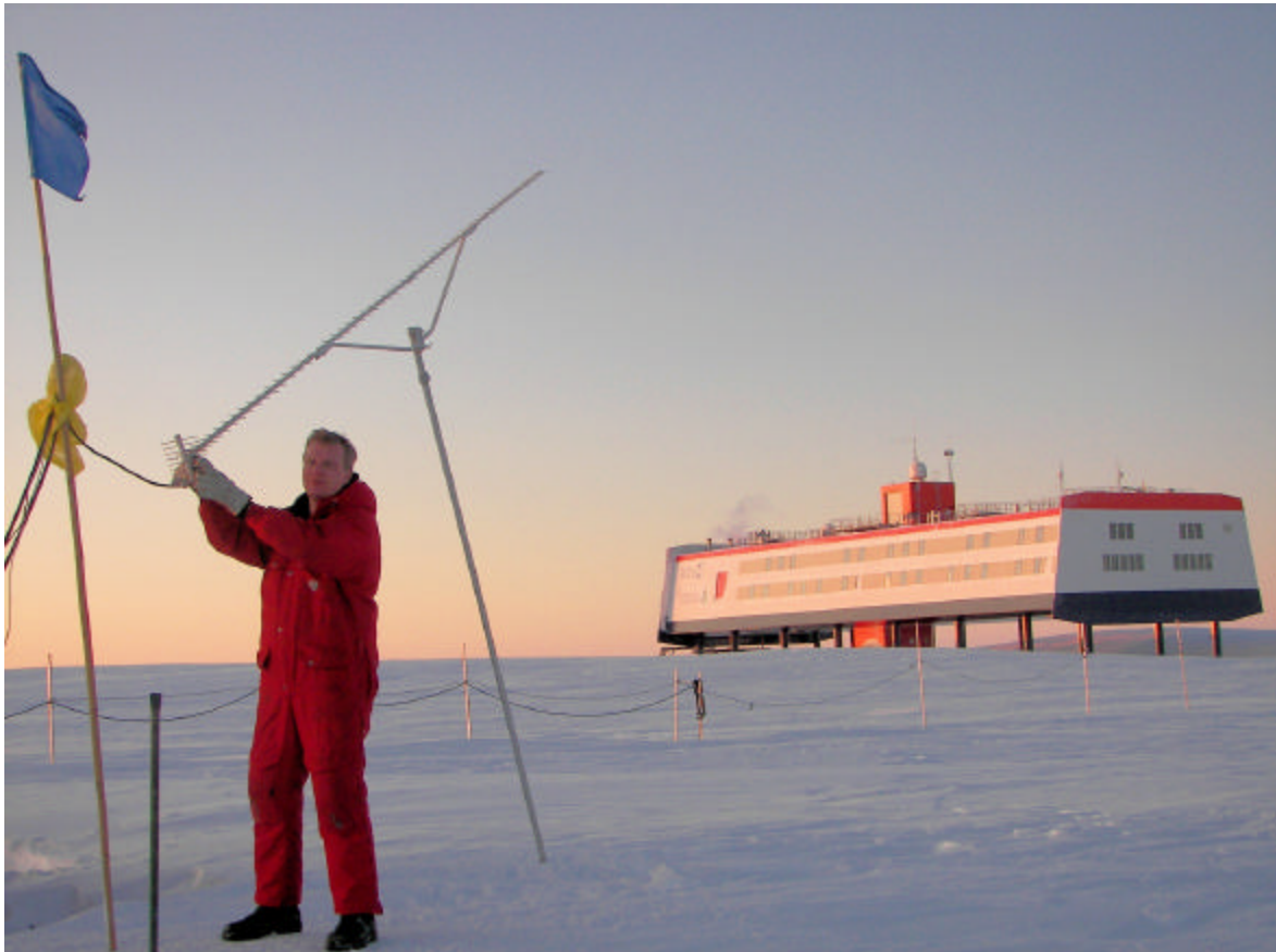
DP1POL – Felix & 67 el yagi. It is winter at the South pole!

Most hams think it takes a big antennas and high power to work EME. This talk will focus on 1296 and 432 and try to change this impression by showing examples of how little it takes to make QSOs off the Moon.