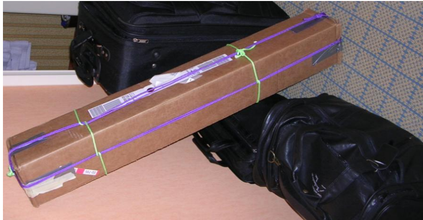
The complete EME station fit in one box and a carry-on bag.

I used a 7' stress dish and a 150 W SSPA. The whole station fit into a small box and a carry-on suitcase.