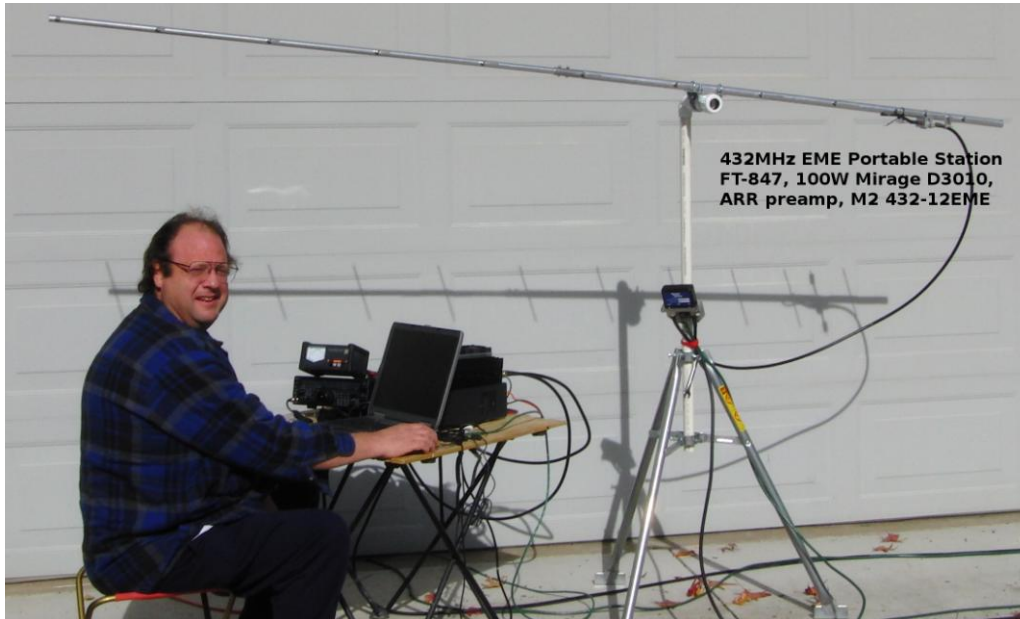
K6CLS with rig and 12 el yagi use on 70 cm EME

never heard me. I stayed up and called CQ for another hour, but no more QSOs because by that time it was moonset for EU, bedtime for NA, and too early for the VK/JAs. Finally I noticed I was really cold and tired! The station is outdoors, in the garage, it was 4 degs C and 80% humidity, bone-chilling cold. What a thrill, EME is the biggest thrill ever in ham radio.”