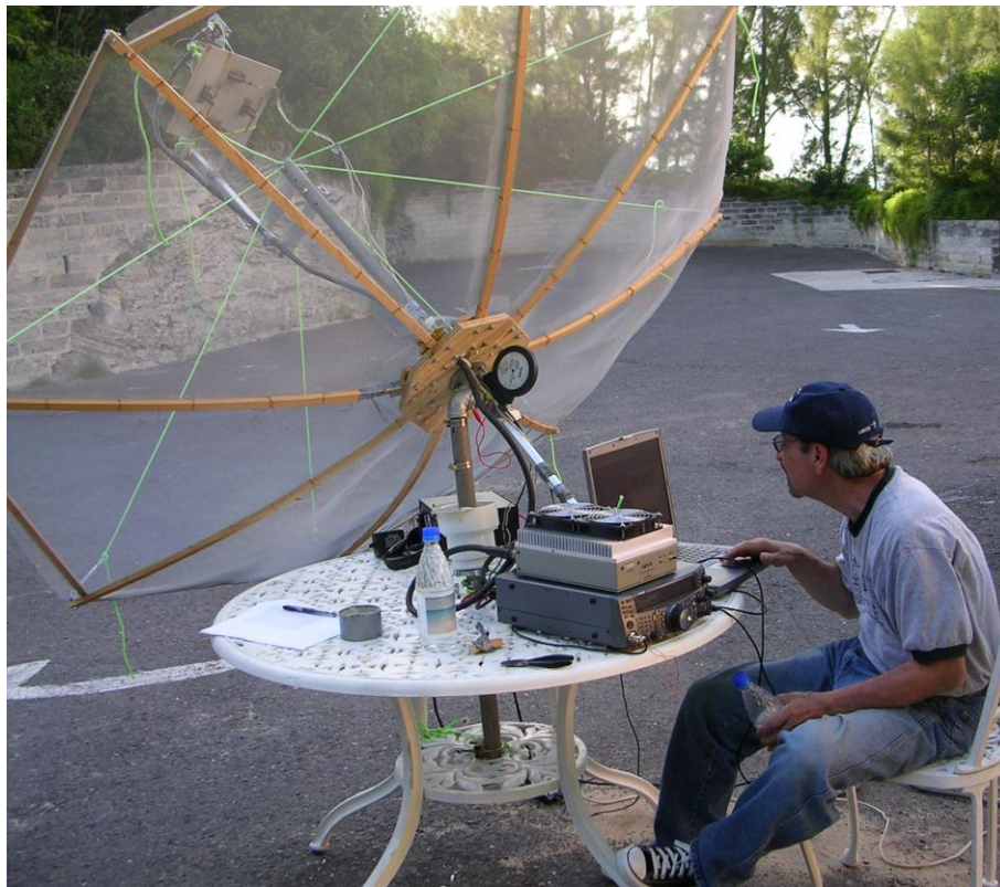
7' compact dish, SSPA and TS2000X

I have also included a picture of my own 1296 dxpedition effort to Bermuda.