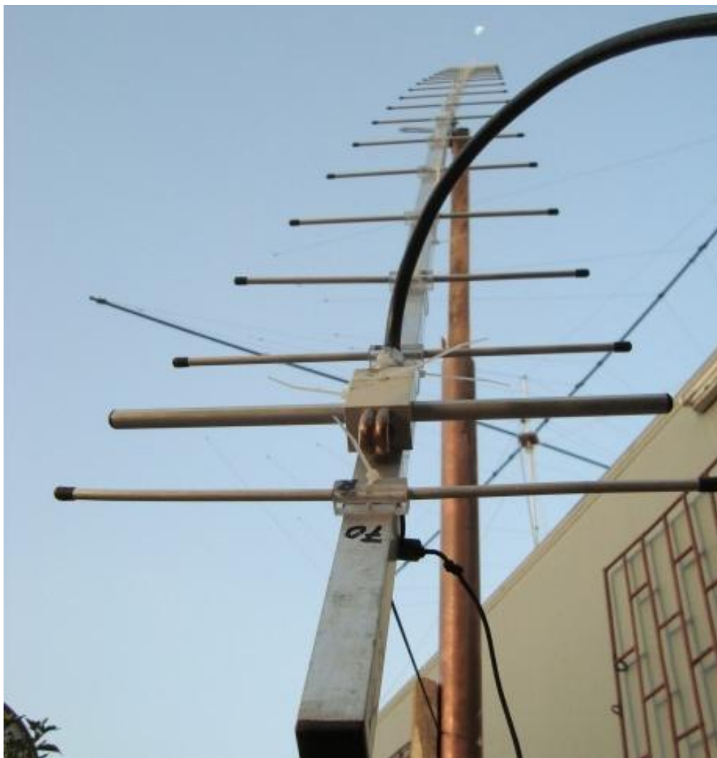
5N0EME 70 cm yagi pointed to Moon (DL3OCH Nigeria)