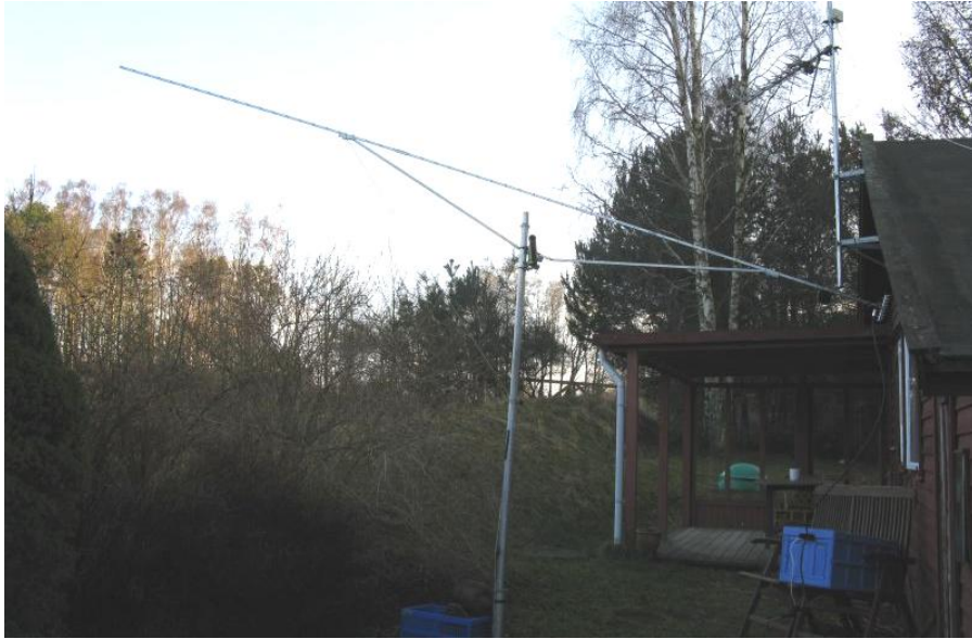
OZ/DJ8MS's mini 23 cm EME dxpedition (JT & CW) QTH

single 67 el yagi and 100 W follows. Tor QSO'd DJ9YW, G4CCH, K2UYH at -21 dB, ES6DO and OE9ERC on JT and CW.