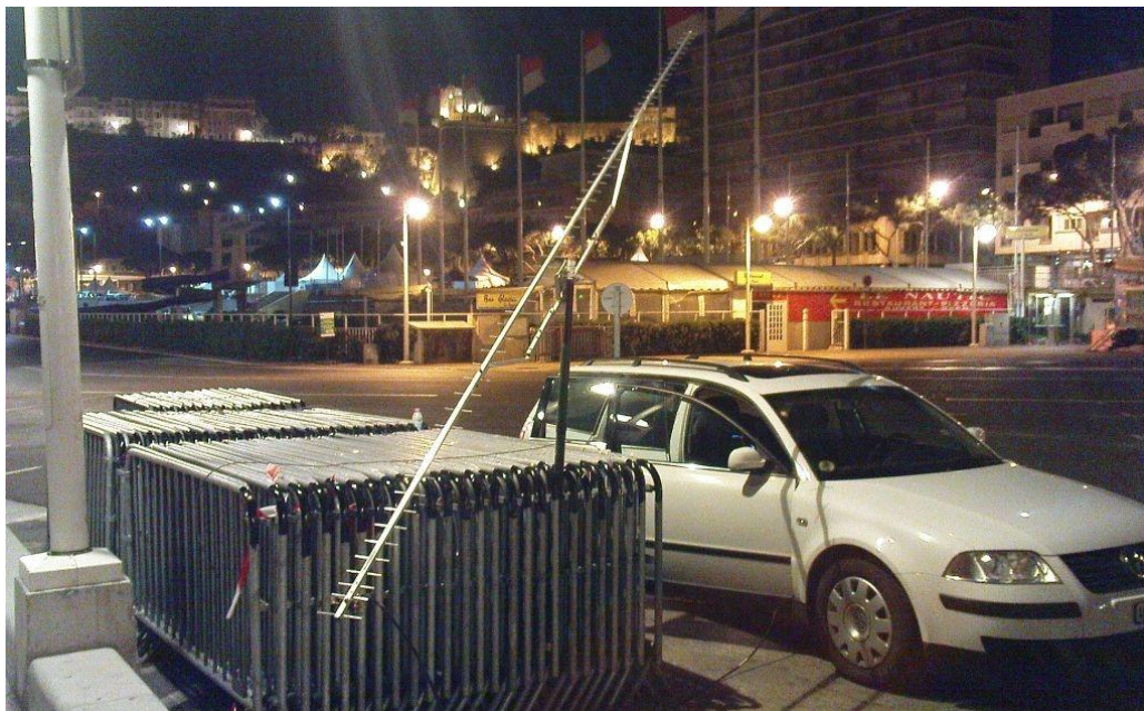
3A/DL3OCH operating 23 cm EME from Monaco

Probably the greatest fun of small station EME is the ability to operate portable EME without a huge amount of effort to provide rare, hard to work locations. As already noted, DL3OCH has done more of this kind of operation than anyone else. Below is a picture of typical Bodo operating location.