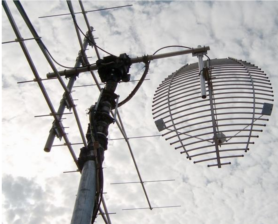
OK1TEH's antennas including dish used on 23 cm EME

Probably the greatest fun of small station EME is the ability to operate portable EME without a huge amount of effort to provide rare, hard to work locations. As already noted, DL3OCH has done more of this kind of operation than anyone else. Below is a picture of typical Bodo operating location.