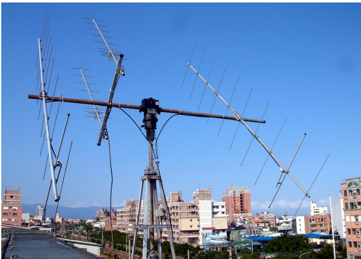
BX1AD 2 yagi array used on 70 cm EME

There are now many successful small station 432 EME stations. Some are running a single yagi and 50 W. The smallest power wise is W5RZ. He worked DL7APV using JT65B using only 2 x 9 el yagis and 5 W at the feedpoint!